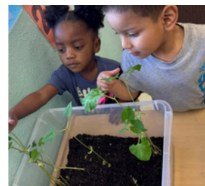
Sunrise Children's Foundation Nevada

From curious questions in the classroom to discoveries in the garden and beyond – Early Childhood STEM Week 2026 was everything we hoped it would be and more. Thank you to every educator, family, home visitor, and community partner who showed up, leaned in, and reminded us all that STEM begins the moment a child asks "why?"