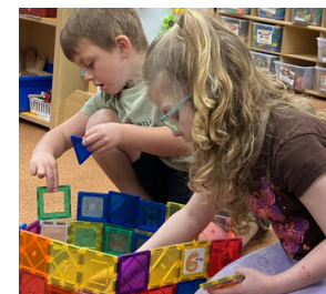
Community Action Opportunities North Carolina